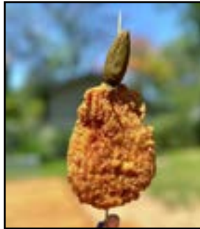
Las Palapas, Polly Rocha

It's standing shoulder-to-shoulder at Battle of Flowers, waving at the floats and catching eye contact with a dancer as they toss beads your way. It's getting doused in confetti by a cascarón when you least expect it. It's staying out too late at NIOSA, dancing to cumbias with people you just met, covered in glitter, laughing over a shared plate of chicken-on-a-stick.