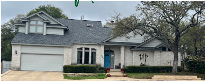
Dale Saulsberry 3622 Hunters Dream