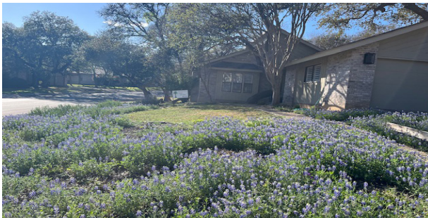
Honorable mention A Blaze of Bluebonnets Mary Langford - 13055 Hunters Breeze