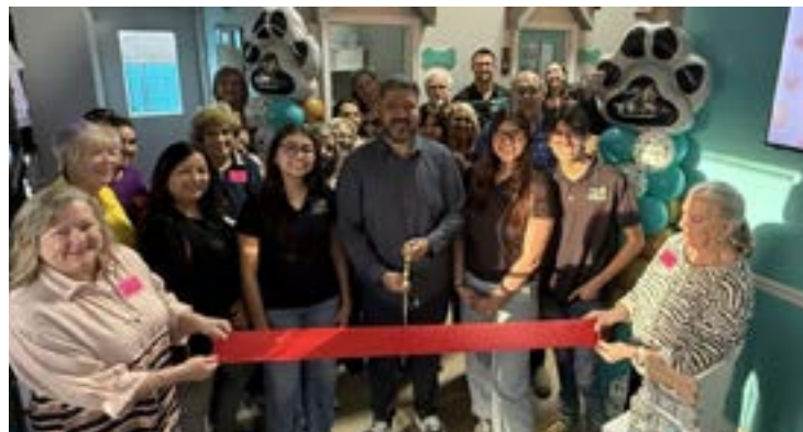
Cutie Paws Daycare & Boarding