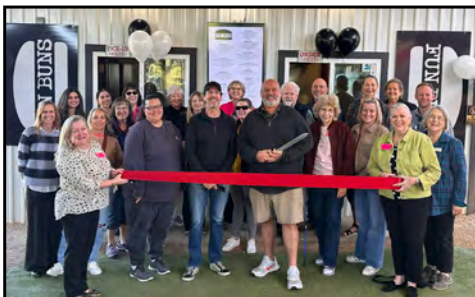
Fun Buns of TX at District on 46 - Ribbon Cutting