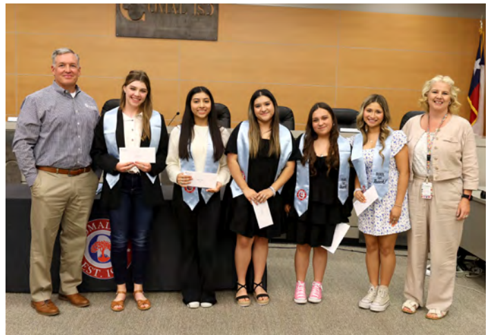
Ready, Set, Teach seniors from Pieper High School.