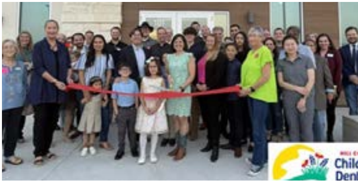
Hill Country Childrens Dentistry