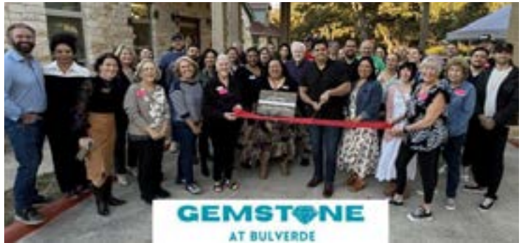
Gemstone Senior Living Community