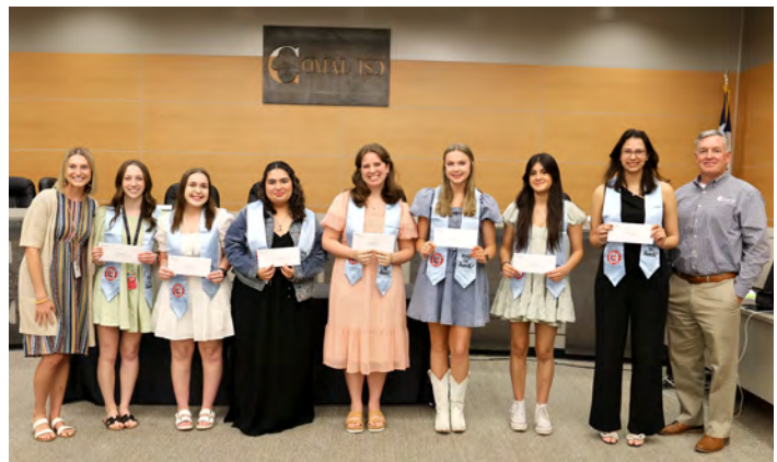
Ready, Set, Teach seniors from Smithson Valley High School.