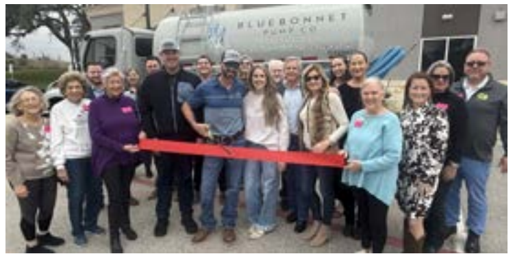
Bluebonnet Pump Co