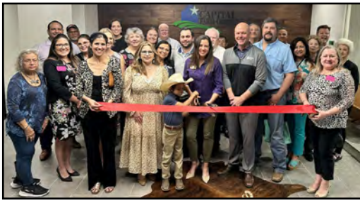
Capital Farm Credit - Ribbon Cutting—New Location