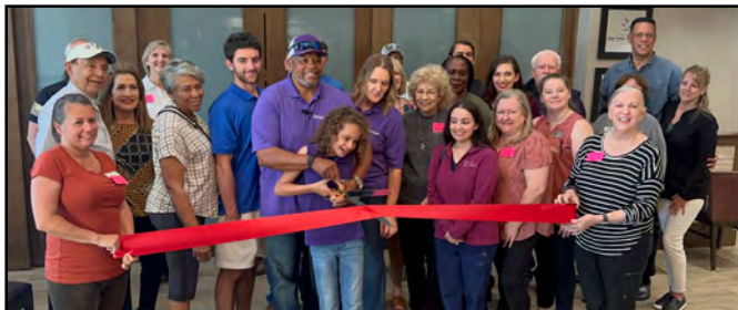
iPlanned - Ribbon Cutting