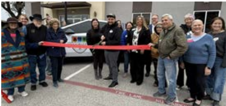
Restoration Solutions by Elite