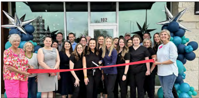
Uplifting Medi Spa - Ribbon Cutting