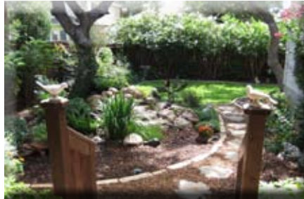
Backyard waterfall using recycled water: TX hardy plants

have to cut them to the ground in the spring. Some other nice grasses are Gulf Muhly and Mexican Feather Grass. Medium sized evergreen shrubs also work well.