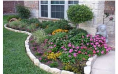
Full sun flower bed: Vinca, dianthis, marigolds, lantana-all TX hardy

Sago palms also do well here but they are very slow growing. In fact they're so slow growing they look like a shrub for many years.