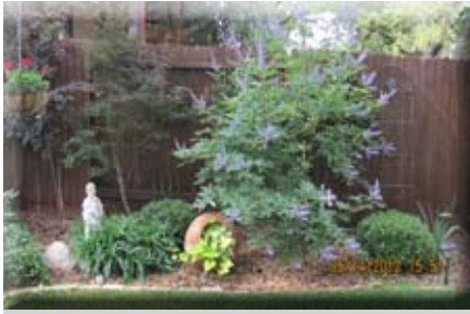
Filtered light flower bed: Vitex tree or Texas lilac in center, Japanese maple to the left

break it up. Dig the hole wider and deeper than the root ball then fill it with a mixture of good soil and the soil that you dug up.