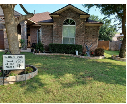
Estates at Settlers Park 2945 Todd Trail