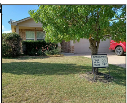
Settlers Overlook 2824 Bluffstone Dr.