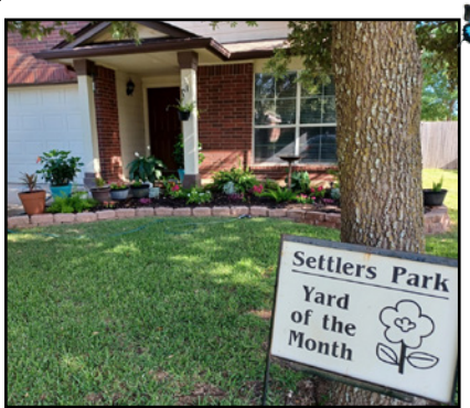
Settlers Crossing 2136 Pearson Way