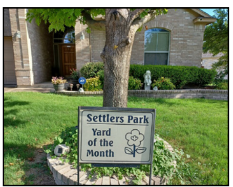
Estates at Settlers Park 2141 Settlers Park Loop